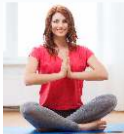
Yoga / Meditation